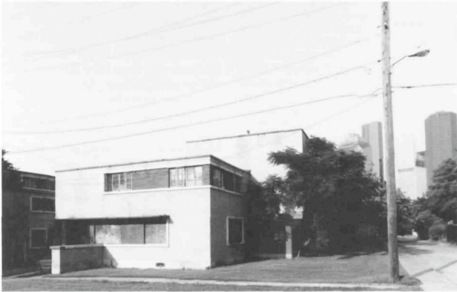
Allen Parkway Village, built in 1943 and designed by a group of architects led by Mackie & Kamrath.