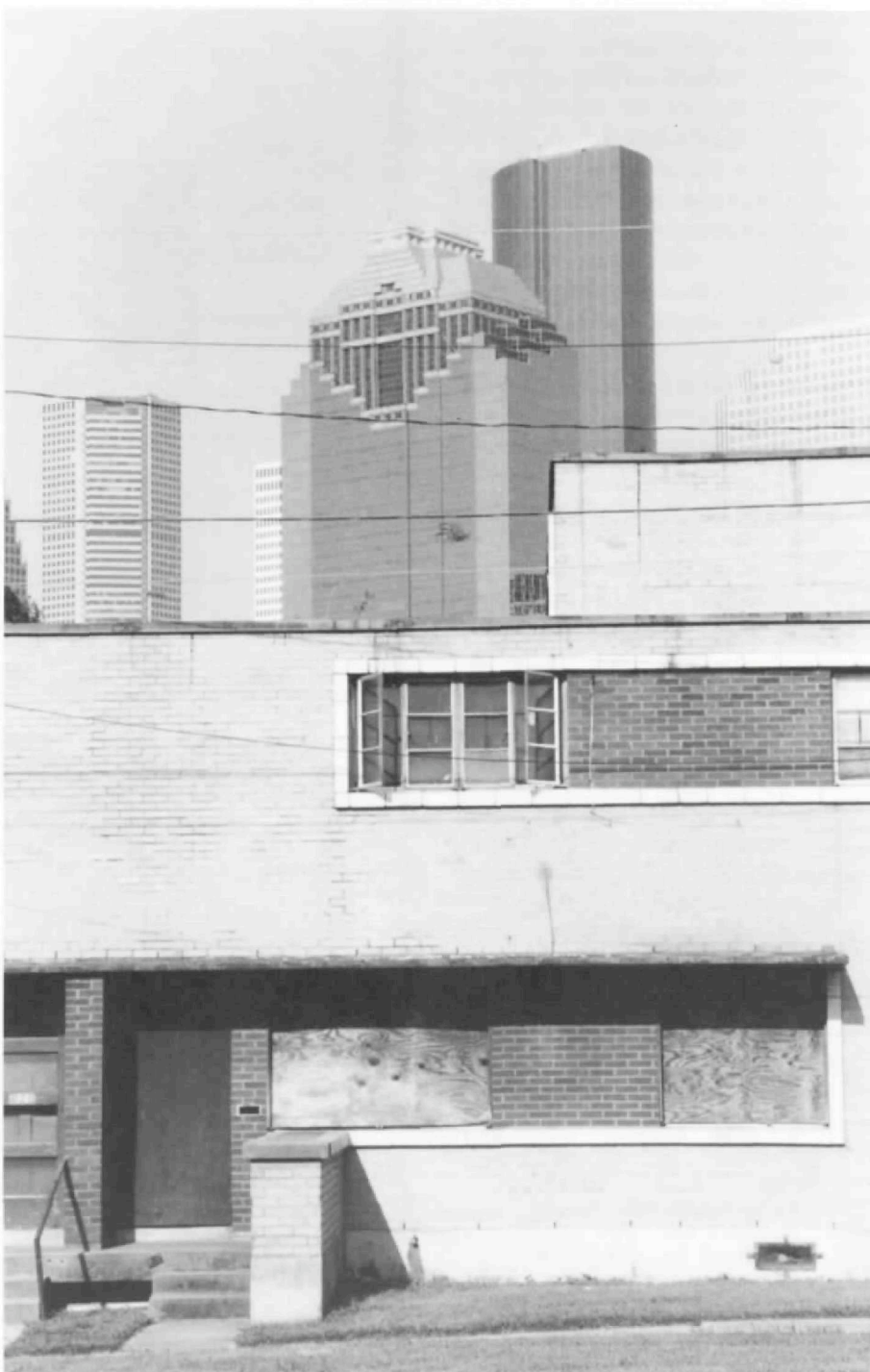
Allen Parkway Village, 1995. Its 1,000 apartments make up more than 24 percent of all public housing units in Houston. Only 21 apartments are currently occupied.

private homebuilders and savings and loan associations, who launched vigorous attacks on public housing, accusing it of being socialistic and representing unfair government competition with free enterprise. . . . They played major roles in organizing local communities to oppose the siting of public housing." 2