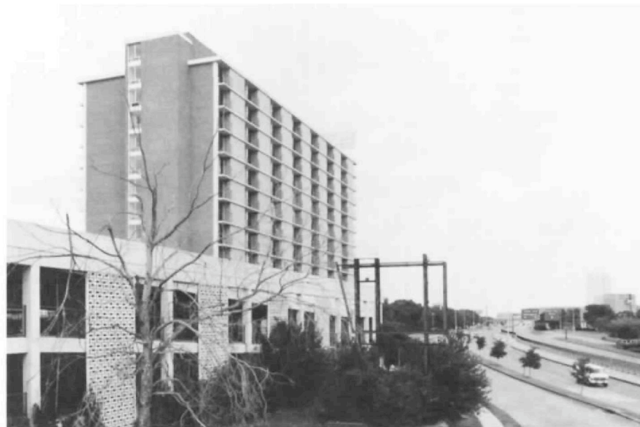
HACH sank more than $2 million into this former Holiday Inn on Memorial Parkway, even though it never owned the building. The public-private project was abandoned in 1989.

In 1990, HACH's 1970s investments in unsubsidized housing in the form of suburban apartment complexes, such as the