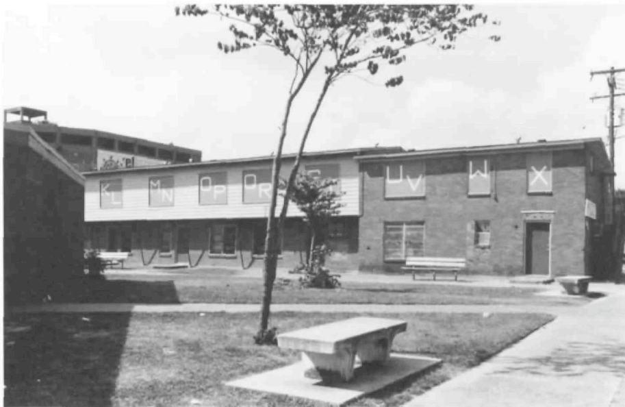
The daycare center at Clayton Homes. El Mercado del Sol is visible in the background.